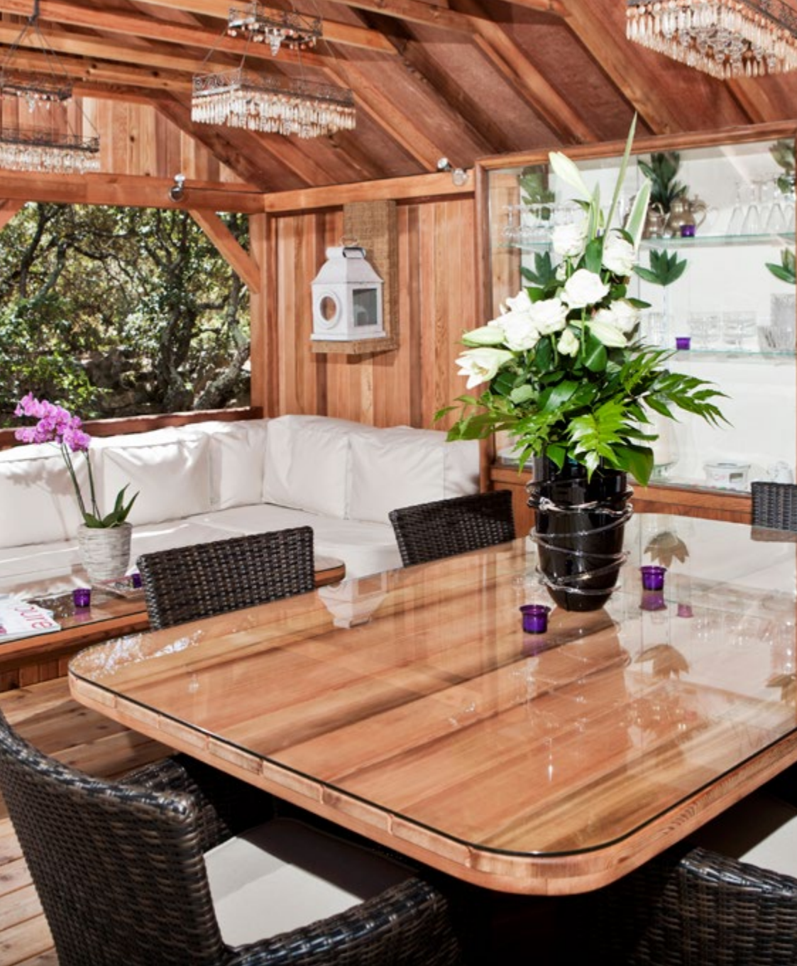
Crown Orangery (Cedar)