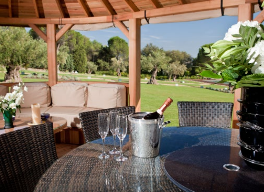
Crown Hampton (Cedar)