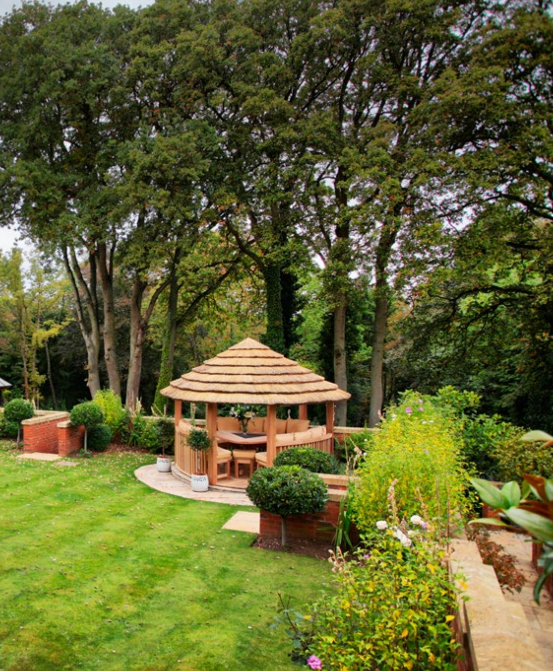
Crown Guinevere (Cedar)