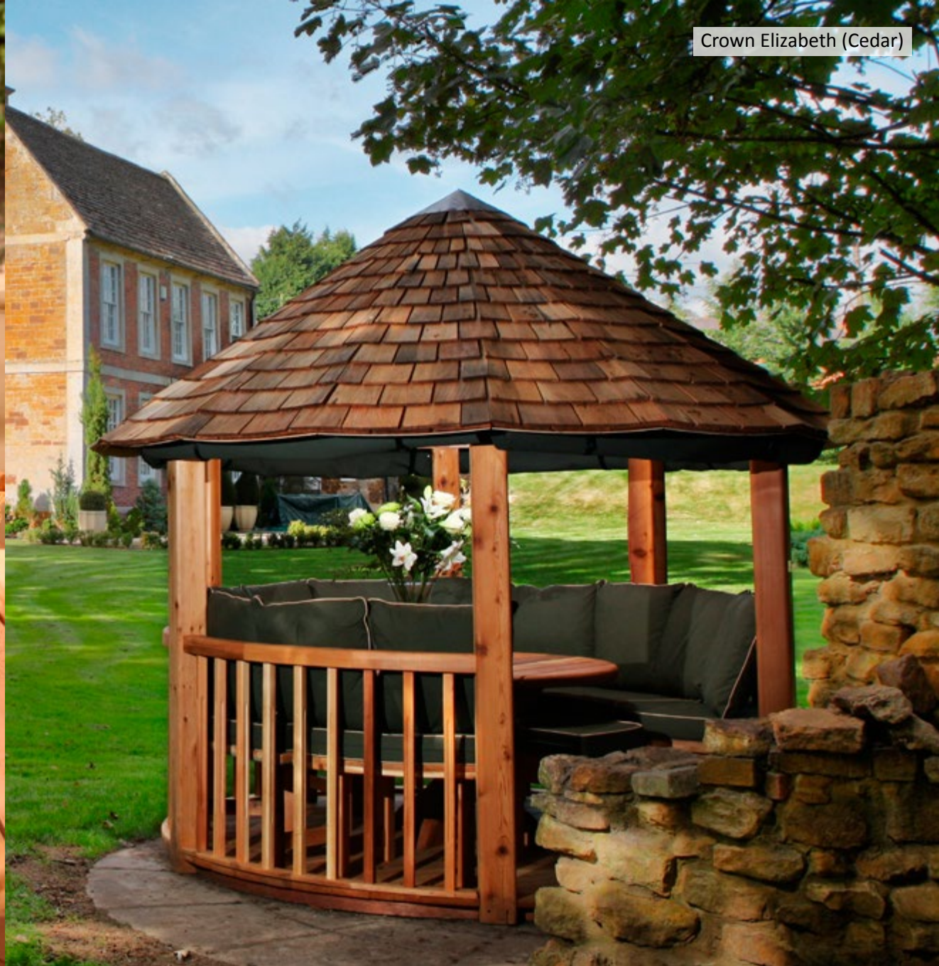
Crown Elizabeth (Cedar)