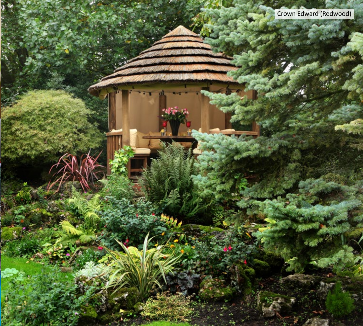
Crown Edward (Redwood)